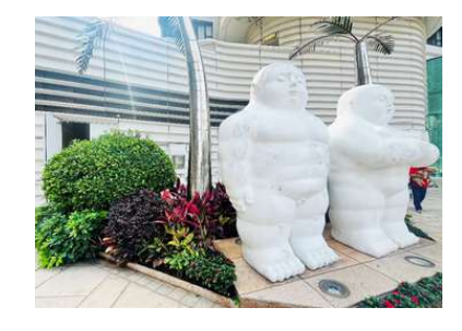
Tower 8A & B, Phase 6 第6期8A及B座旁