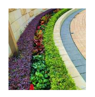
Driveway near Main Gate of Phase 1-3 第1-3期大閘附近車路