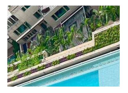
Outdoor Swimming Pool near Phase 6 近第6期室外游泳池