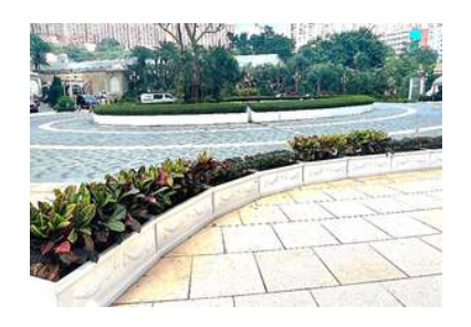
Phase 4-6 Car Park Entrance 第4-6期停車場入口旁