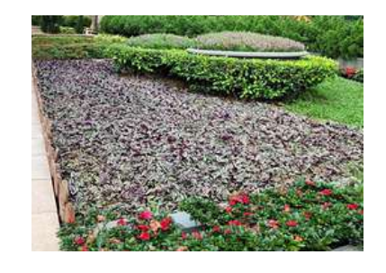
Main Gate Area of Phase 1-3 第1-3期大閘旁